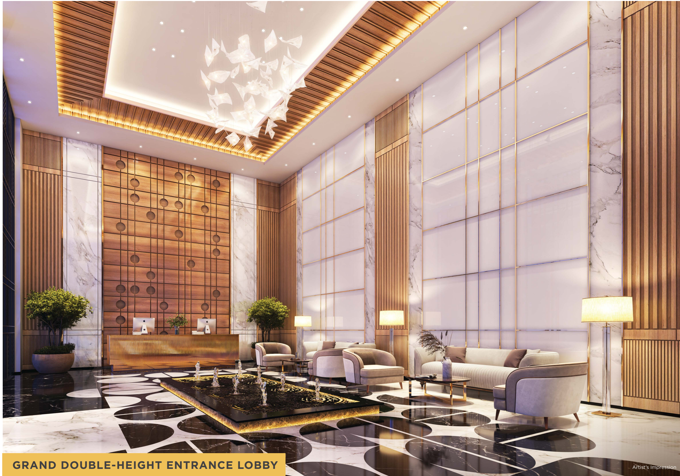
GRAND DOUBLE-HEIGHT ENTRANCE LOBBY