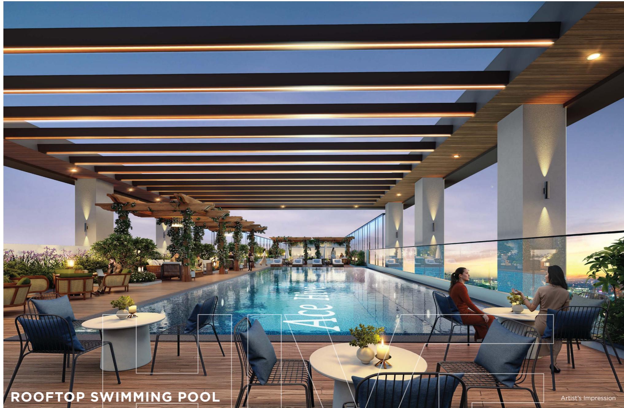
ROOFTOP SWIMMING POOL