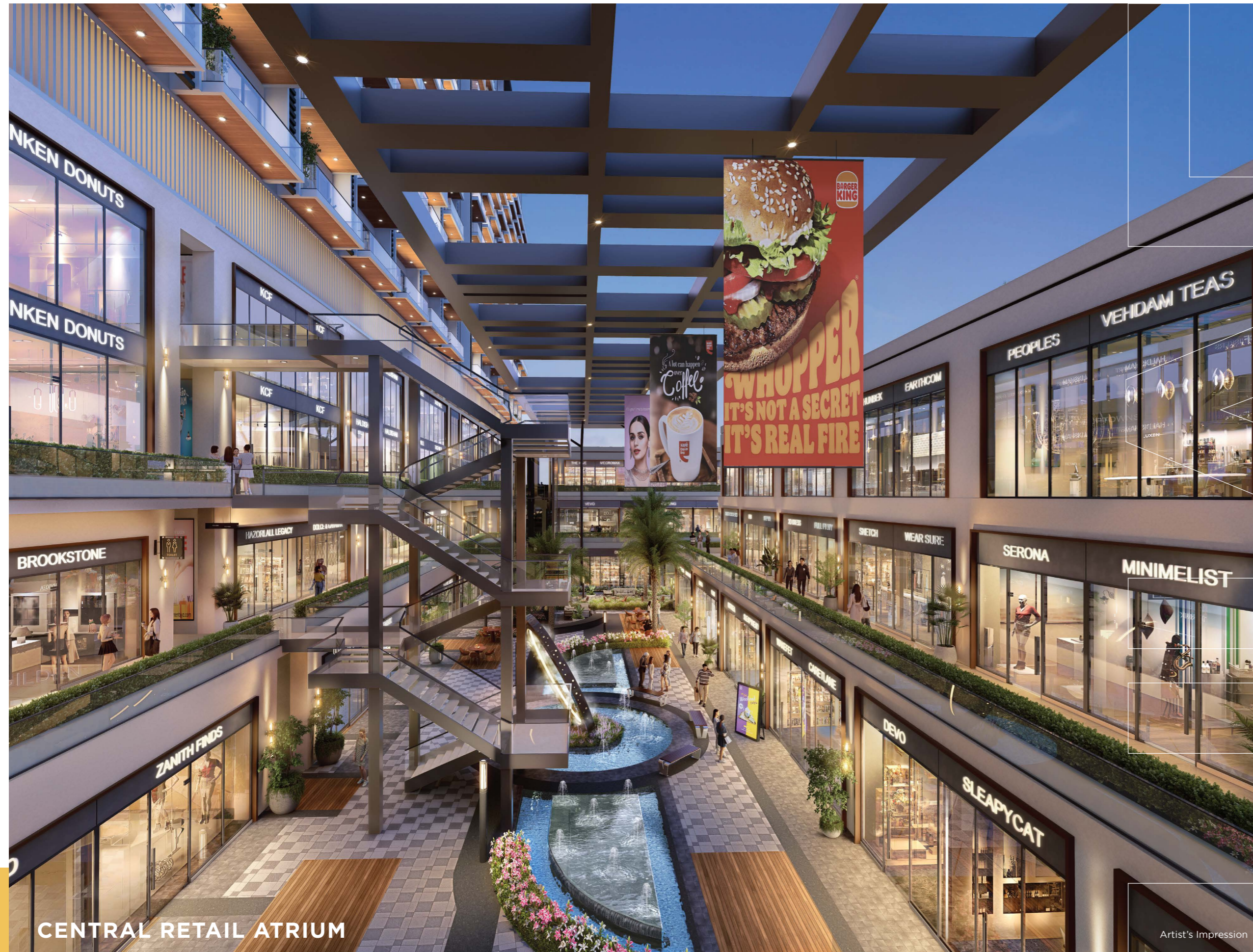
CENTRAL RETAIL ATRIUM