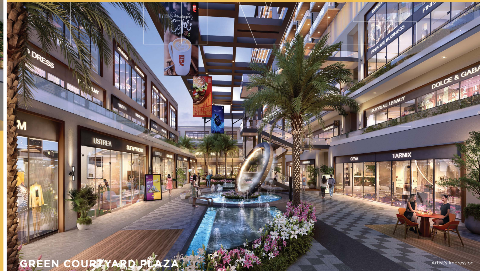
GREEN COURTYARD PLAZA

Step into a retail ecosystem designed for success. This shopfronts have seamless connectivity with high daily footfalls drawn by a vibrant mix of shopping, dining, and leisure experiences. Backed by future-ready infrastructure, premium design, and a thriving catchment, it offers every advantage a modern business needs - from operational efficiency to customer appeal - making it the ultimate stage for retail growth and long-term prosperity.