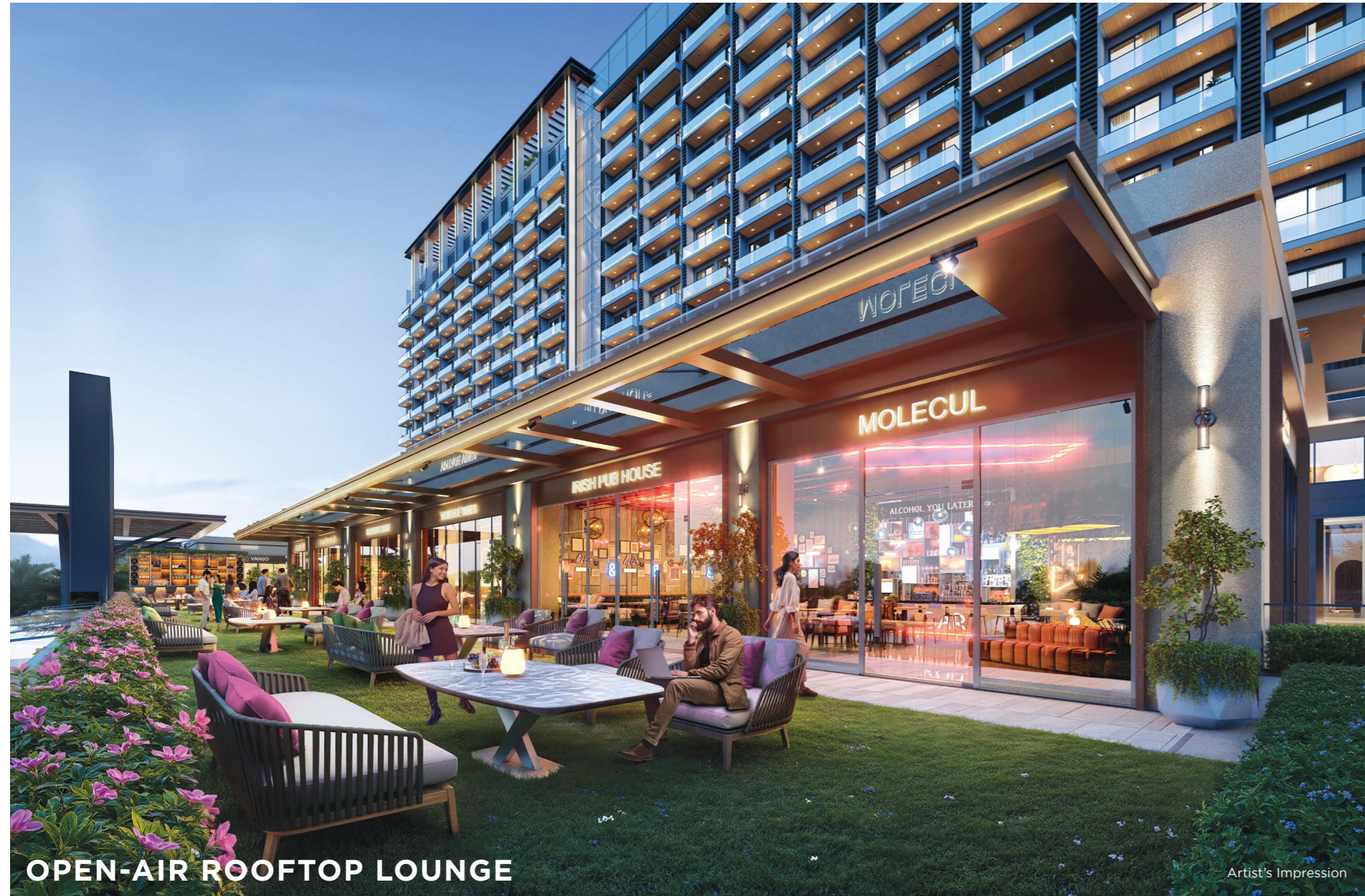
OPEN-AIR ROOFTOP LOUNGE