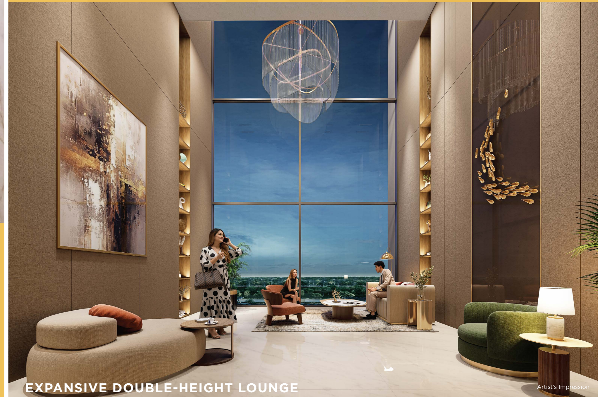
EXPANSIVE DOUBLE-HEIGHT LOUNGE

Step into an inviting double-height lounge where style meets comfort in every detail. From the grand entrance to the plush seating and serene ambience, the space is designed to inspire relaxation, conversations, and moments of quiet reflection. Whether it's unwinding after a busy day or hosting meaningful interactions, the lounge becomes your personal haven amidst the city's vibrant energy.