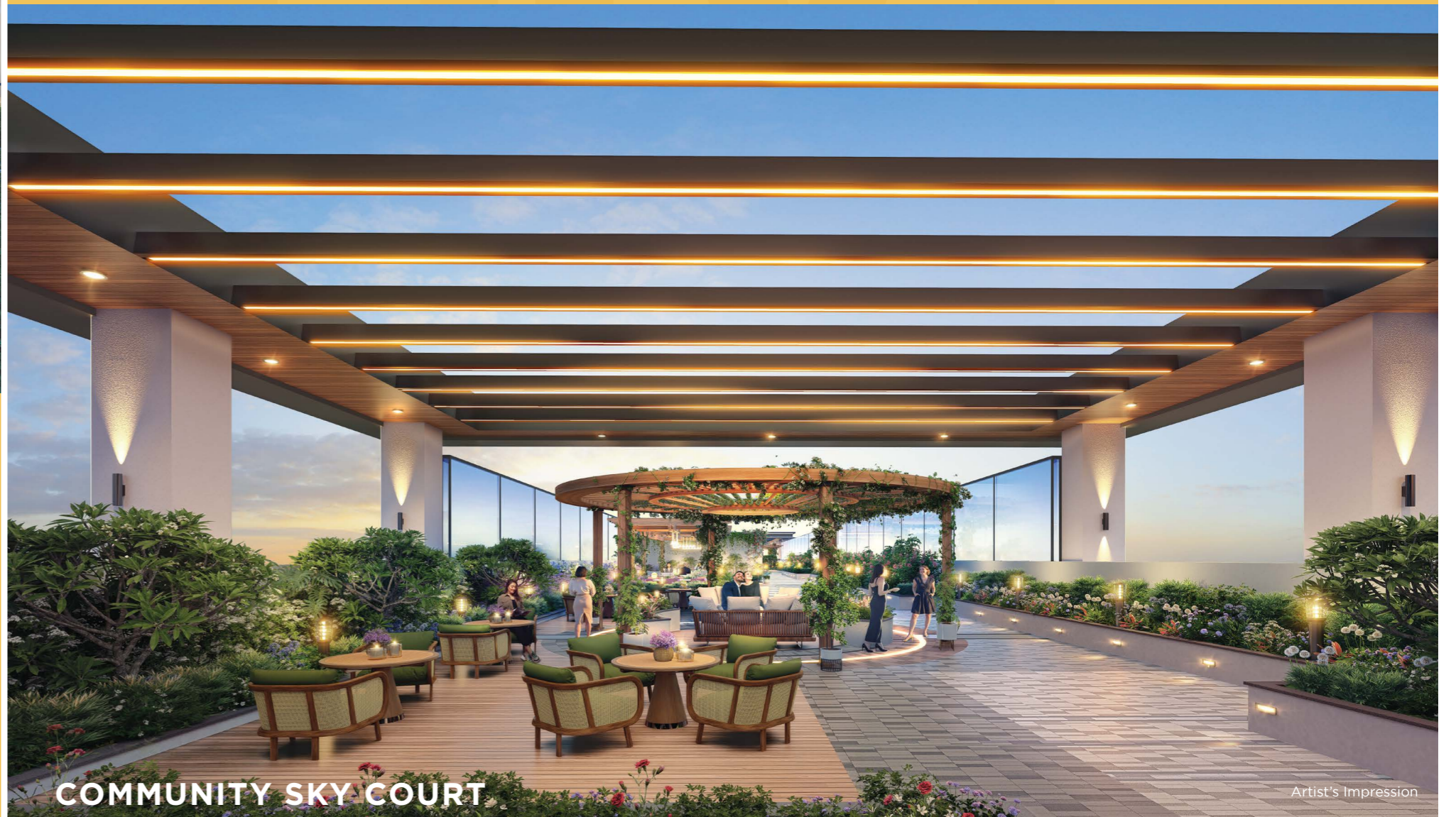
COMMUNITY SKY COURT

Experience vibrant open-air spaces designed for leisure, conversations, and community. From chic café seating to rooftop lounges under a canopy of lights, every corner invites you to connect, unwind, and celebrate life in style.